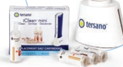
SAO mini Cartridges Item #LQFC204