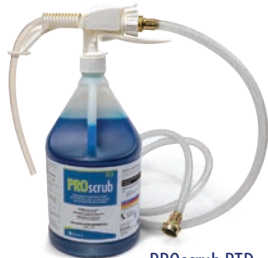
PROscrub RTD Item #LPS303 (dispenser sold separately)

NSF-certified safe for use around food, and with an SDS safety rating better than most deep cleaners and degreasers, PROscrub is ideal for virtually any hard surface including ceramic, tile, metal, industrial flooring, and heavy-duty equipment. It's particularly effective on grout and in other crevices where dirt and grime have accumulated over time.