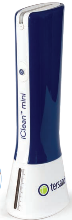
iClean™ mini Item #LQFC200

* For more information on sanitizing test results, please visit www.tersano.com .