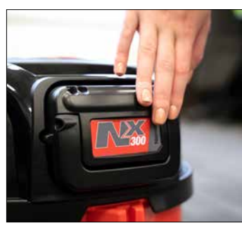
Easy Battery Change