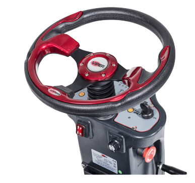
Always in control