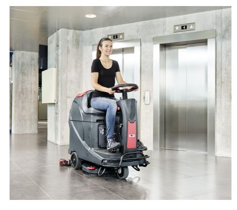
Comfortable with a minimum of training