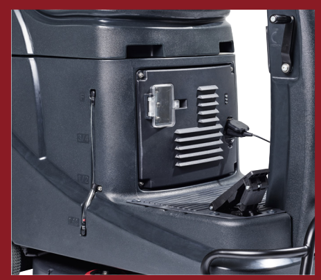
An integrated on-board charger enables easy plug-in and battery charge at any outlet