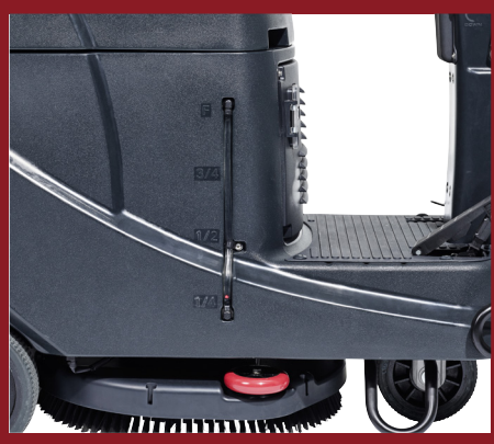
Water solution level indicator with volume visible on the tank