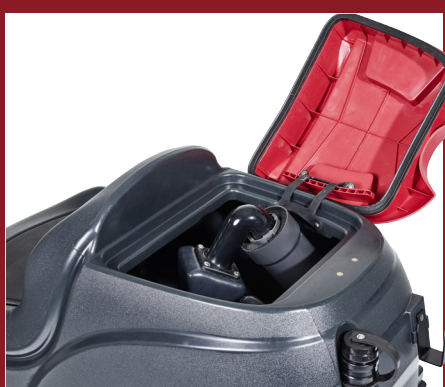
Large opening to the 73 liter recovery tank allows easy cleaning