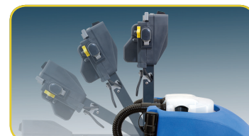
Adjustable control handle