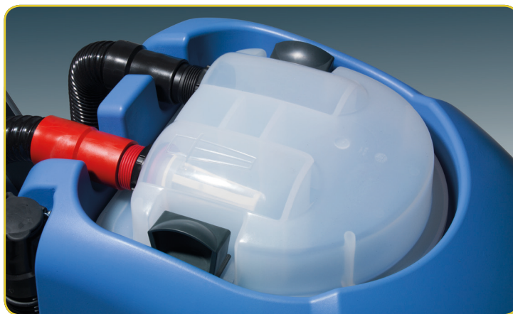
Overfill control and trash filter