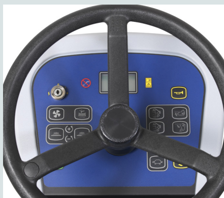
Control panel with icon buttons and modern display to reach best in class ease of use