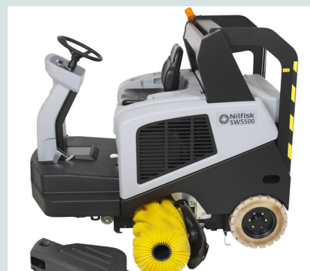
Fast and easy replacement of main components to make it easy daily operations and reduce downtime