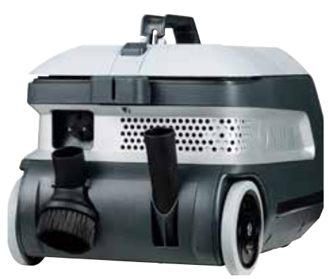
User friendly and easy to reach accessories