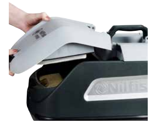
Magnetic hinges ensure high reliability