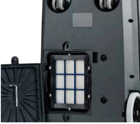
HEPA H13 exhaust filter is standard on all VP600 models