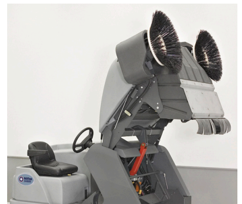
The SW8000 has a superb high-dump capability up to 152 cm from ground level for easy and convenient emptying.