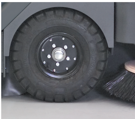
The large wheels give a smoother ride.